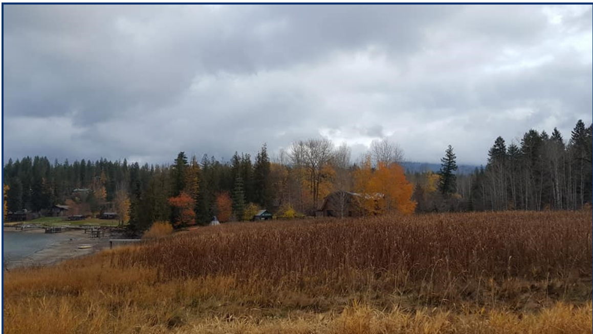
Edge of the Middle Fork of the Clearwater River near Kooskia, Idaho

*Federal Fiscal Year: October 1—September 30