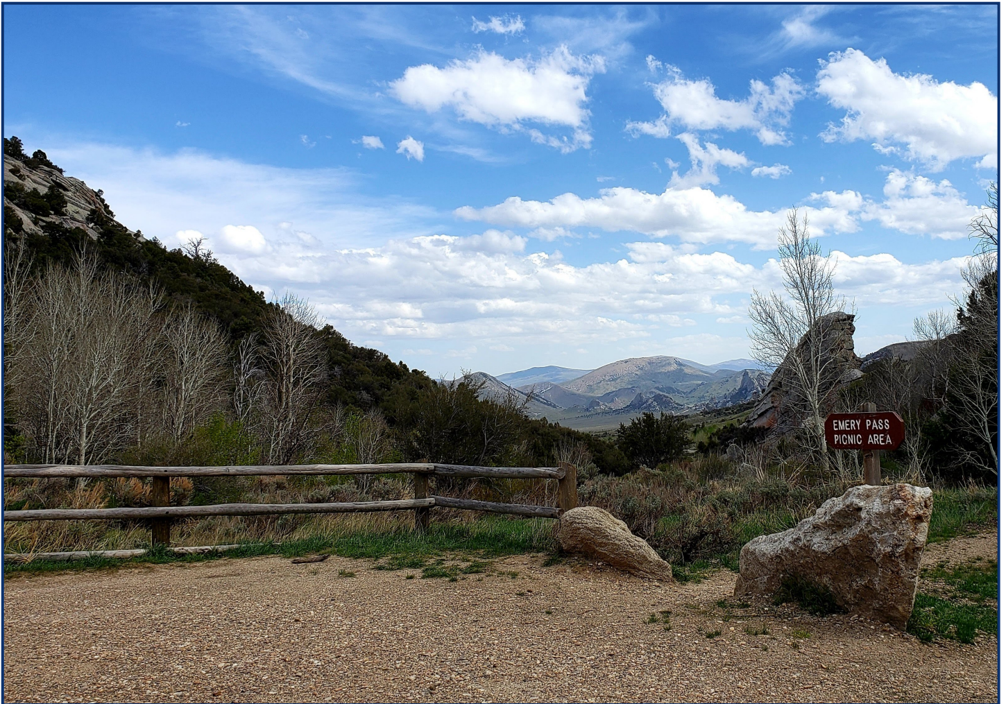
Emery Pass Picnic Area, City of Rocks National Reserve, Almo, Idaho