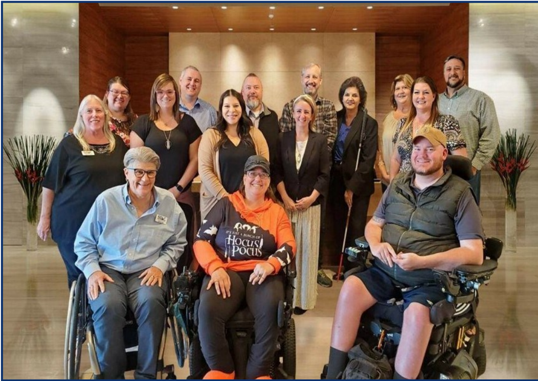
2023 Idaho SILC members and staff

The State Independent Living Council (SILC) is Idaho's only statewide, cross-disability organization dedicated to independent living and full community inclusion governed by a majority of people with disabilities in service to people with disabilities across the lifespan.